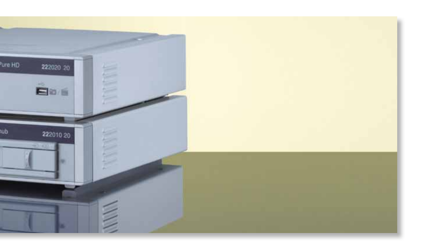
IMAGE 1 Camera Heads, regardless of whether they are high definition, standard definition or designed for videoendoscopy, will continue to work in conjunction with the IMAGE 1 HUB™ Camera Control Unit. The KARL STORZ philosophy aims at a long and future-oriented partnership with our customers.

Integrated image enhancement and brightness control complement the standard feature set. Special fiberscope modes allow excellent image quality for interventions with flexible telescopes and small scopes.